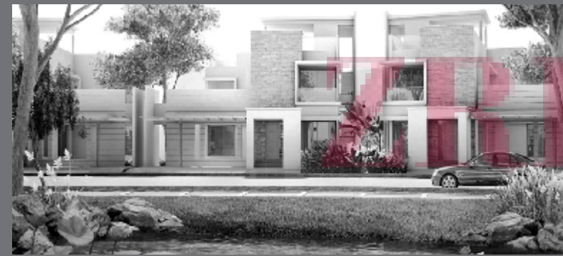
Sterling Villa Grande

For 3 decades now, Sterling Developers continues to be one of the leading property developers in Bangalore. Since inception in 1983, Sterling Developers has changed the landscape of the city. Founded on integrity and values, Sterling has consistently set standards for the industry. For the discerning, this focus on quality represents a far-reaching vision that shines through every Sterling property. Sterling Infinia is an inspiring, contemporary showcase of the Sterling standard.